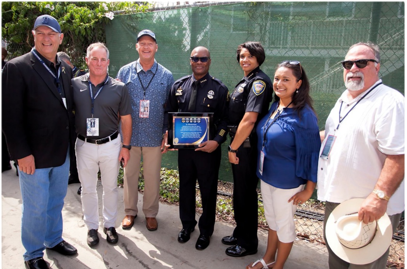
City of Dallas Police Chief accepts plaque in memory of fallen officers.