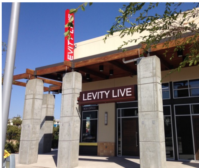
Marlon Wayans performs at Levity Live Oxnard