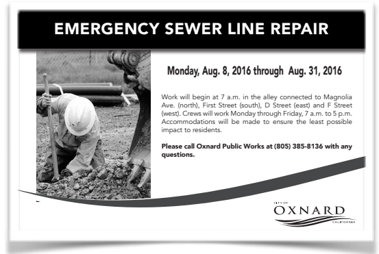
Emergency sewer line repair flyer