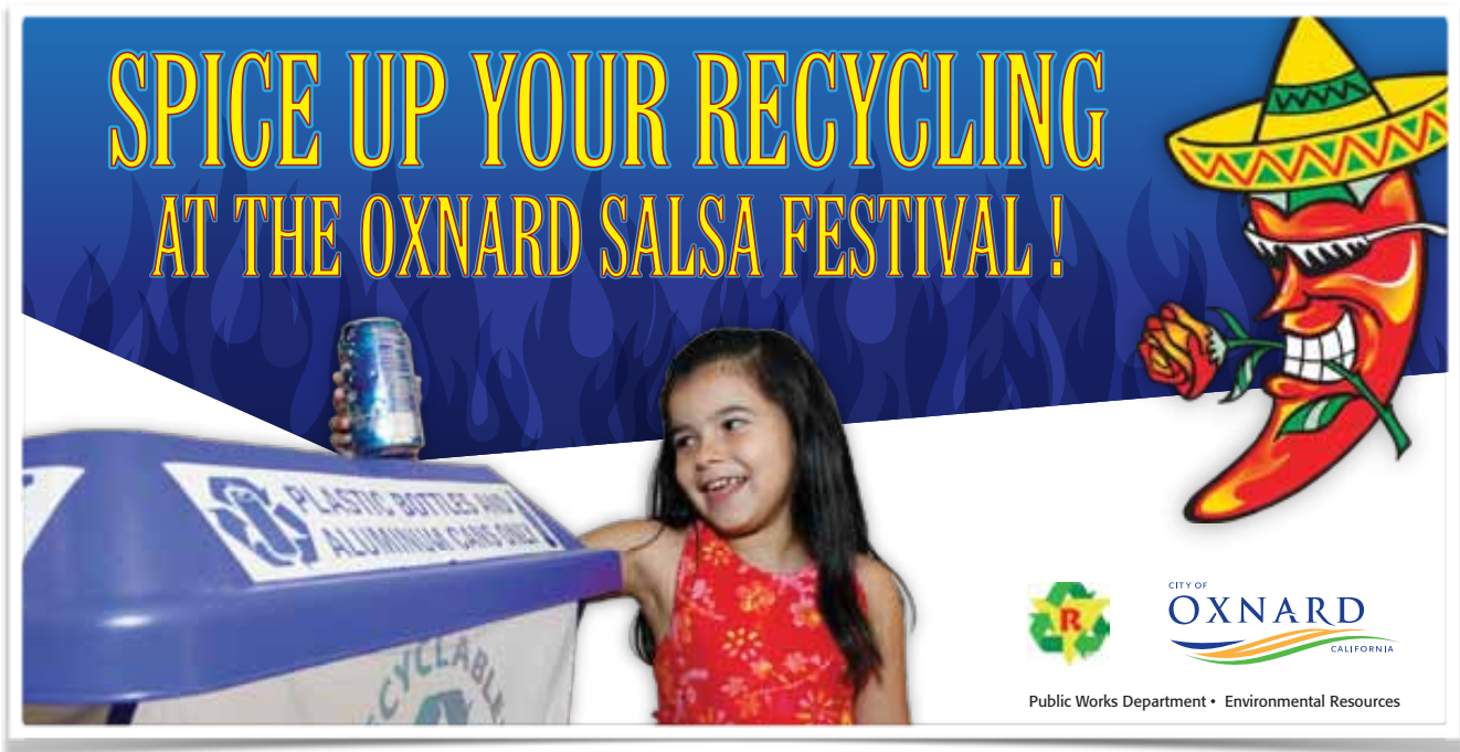
Jumbotron Recycling Ad displayed at Salsa Festival

The Salsa Festival drew an estimated 15,000 people to Oxnard to enjoy dancing and good food.