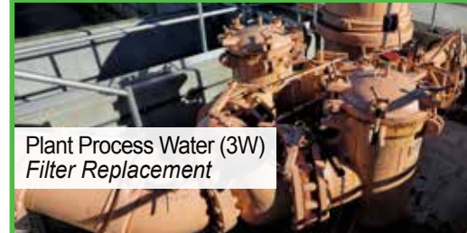
Plant Process Water (3W) Filter Replacement