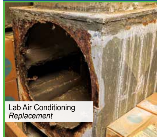
Lab Air Conditioning Replacement

The largest portion of revenue from wastewater fees goes toward debt payments for previous system upgrades. User fees alone are not adequate to cover operations and the extensive equipment replacement that is needed.