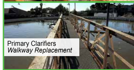
Primary Clarifiers Walkway Replacement