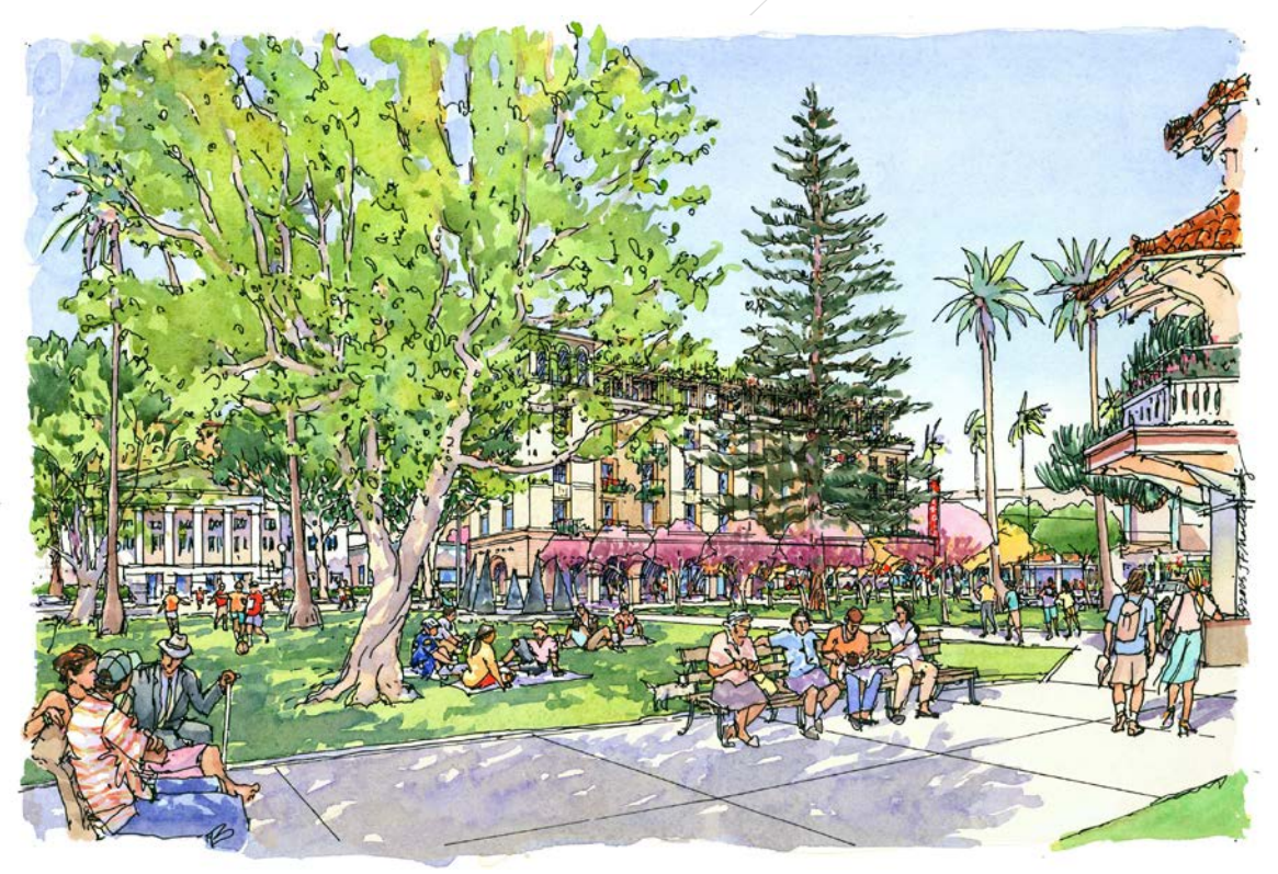
Previous Development Concept of Group C (Plaza Park North)

Downtown Oxnard represents an undiscovered opportunity for new development. It is located just three miles south of the 101 Freeway and three miles east of Channel Islands Marina and the Pacific Ocean. Anchored by Plaza Park, the Oxnard Transit Center, providing Amtrak and Metrolink train service, Carnegie Museum, historic Heritage Square, and a 14-screen movie theater, Downtown Oxnard is ripe for new residential and commercial development.