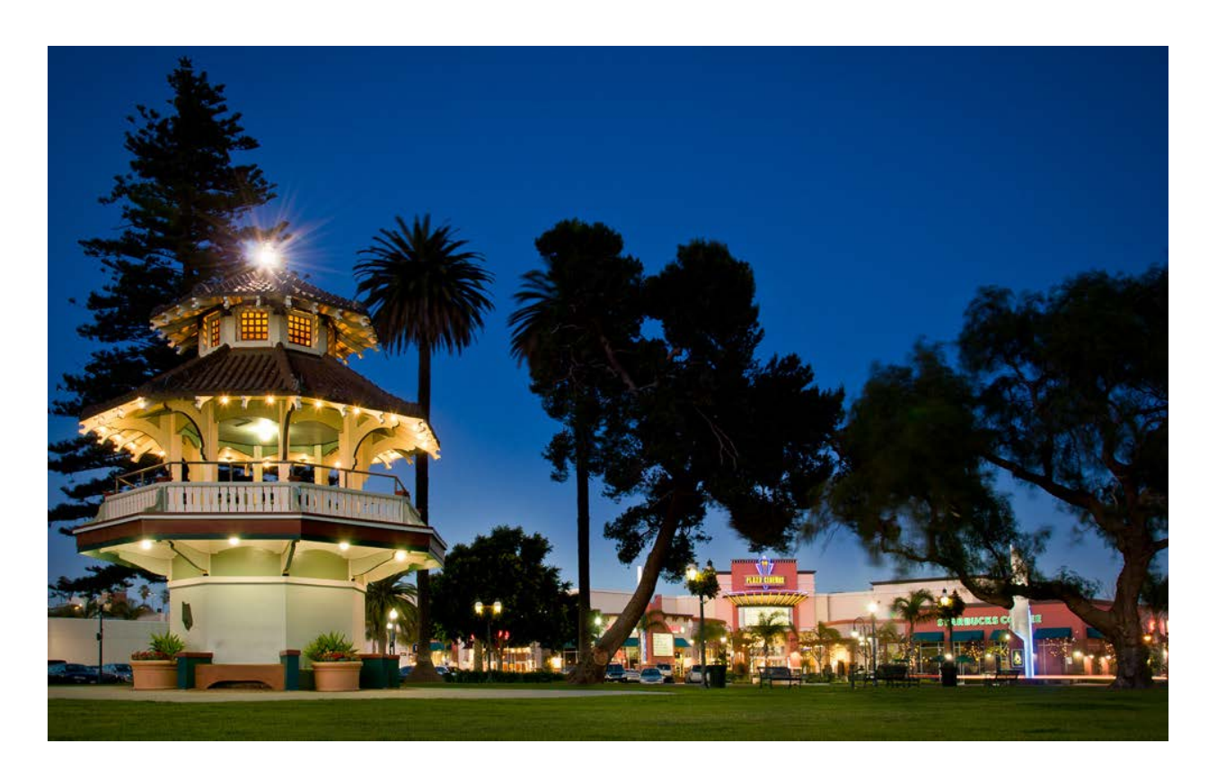
RFQ Issued – Monday, October 23, 2017