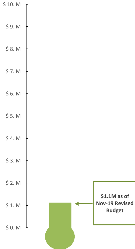
Projected Ending Fund Balance