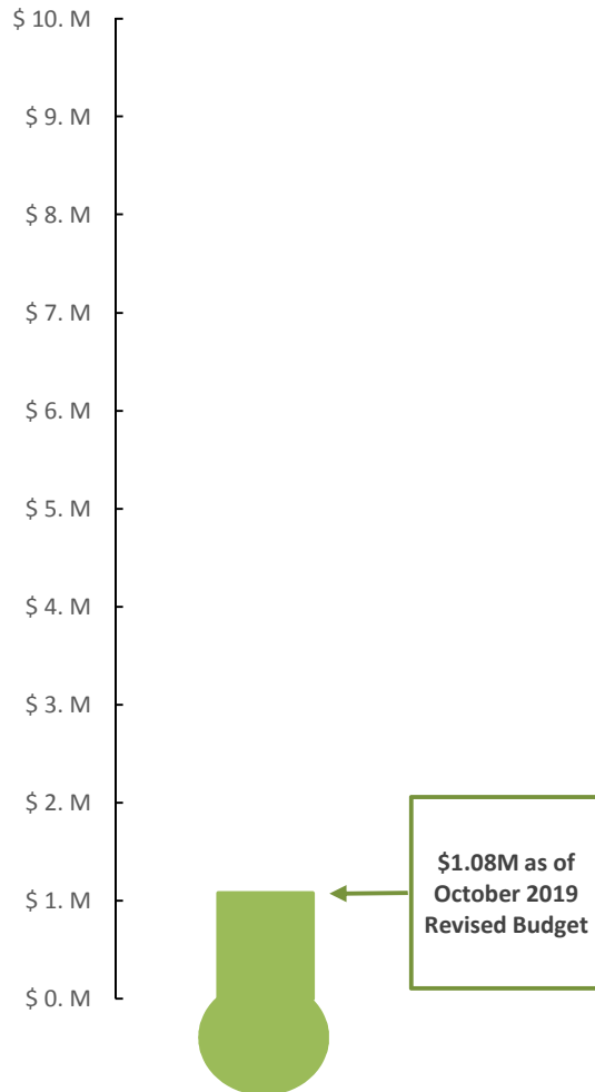
Projected Ending Fund Balance